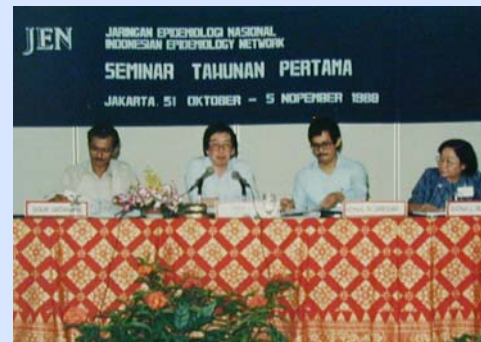
IEN first annual meeting (1988)

Working together with the government, NGOs, national, and international agencies, the IEN empowers the network in implementing health strategies through the application of the health, epidemiology and social sciences to support the community for promoting a better health status