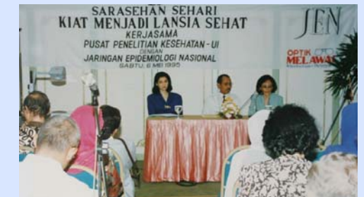
One-day seminar on aging conducted by one of the IEN's members (1995)

Facilitating communication among members through telephone, facsimile, electronic-mail services, and home-page.