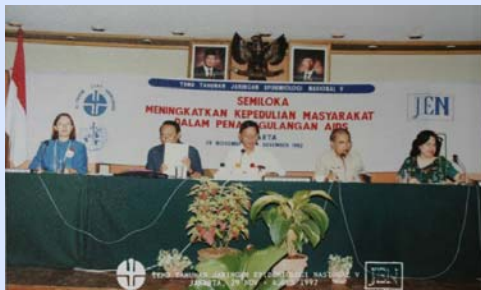
Workshop on AIDS funded by the Ford Foundation (1992)

In order to provide a forum for the members and other institutions to share and discuss ideas or experiences about the most current health issues, the IEN conducts annual scientific meeting. Due to efficiency, starting 1995 the meeting was conducted bi-annually. A management meeting follows every meeting where leaders of the institutions get together to discuss future plans and other managerial/operational issues of the Network.